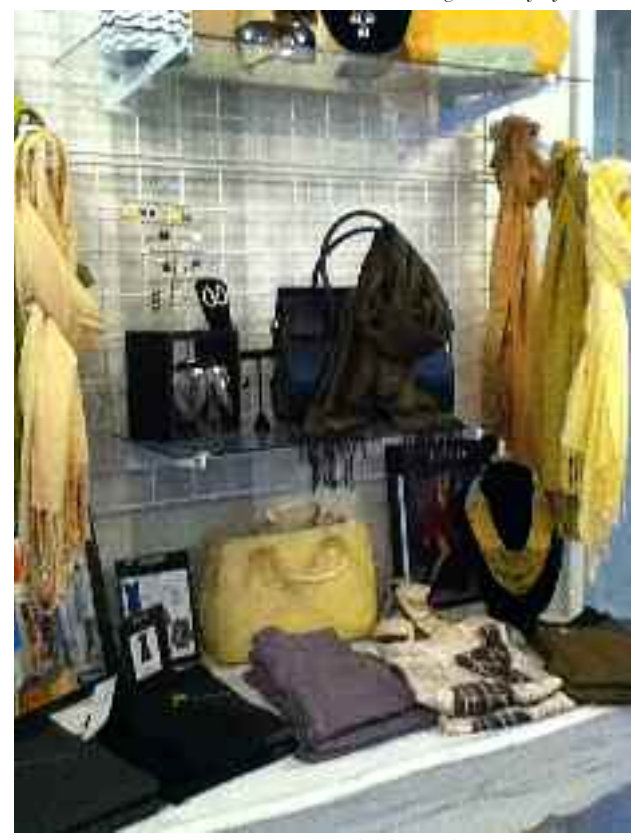
Leggings, tunics and more are available at Glamorous Photo Moya Stone